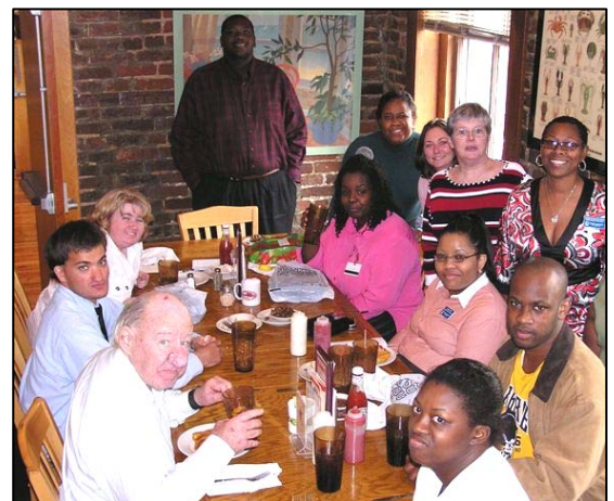
Staff & participants from the New Goods Processing Program, one of the 2 programs to receive a 3-year CARF accreditation