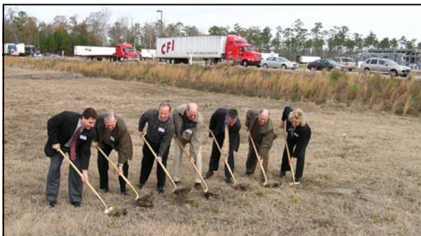
Everyone lends a hand to break ground for the new Myrtle Beach store.