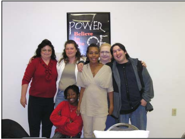
The first 'new and improved' NEO graduates.

As a growing organization, Goodwill Industries of Lower SC has been steadily increasing its workforce to meet the demands of our retail, contract, and administration needs. In order to adequately prepare these new employees for their jobs, a team of staff was tasked with revising the New Employee Orientation (NEO) process. In March, the 'new' NEO process was rolled out with great fanfare and anticipation!